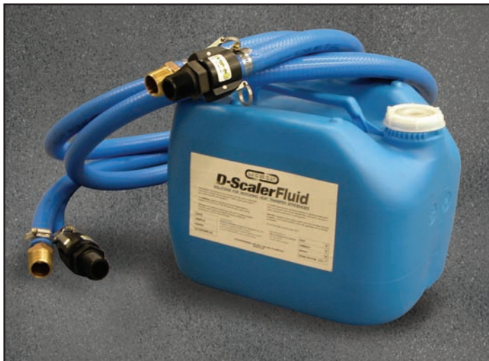
Fluid and hoses are sold separately.